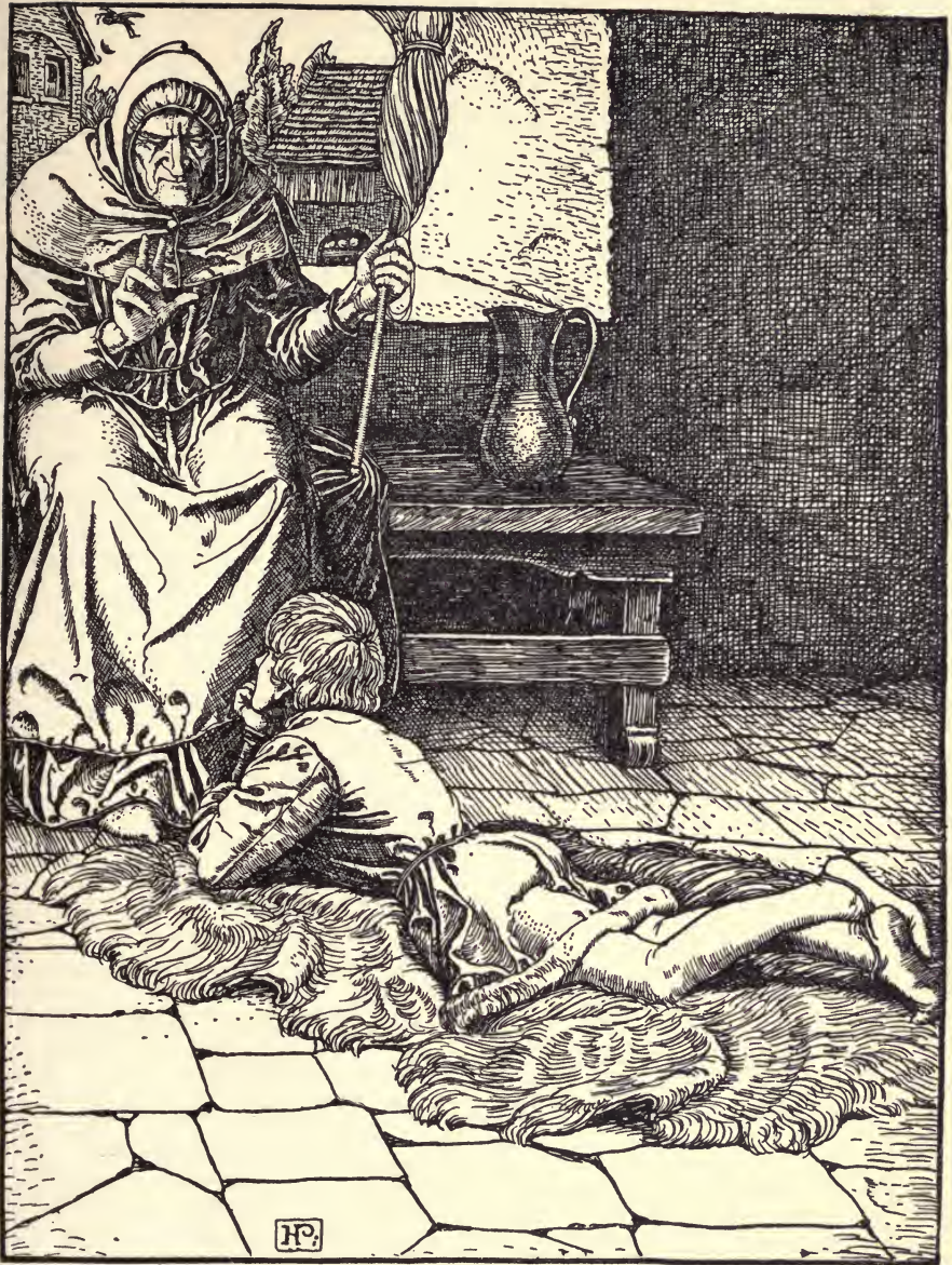
OTTO LAY CLOSE TO HER FEET UPON A BEAR SKIN.