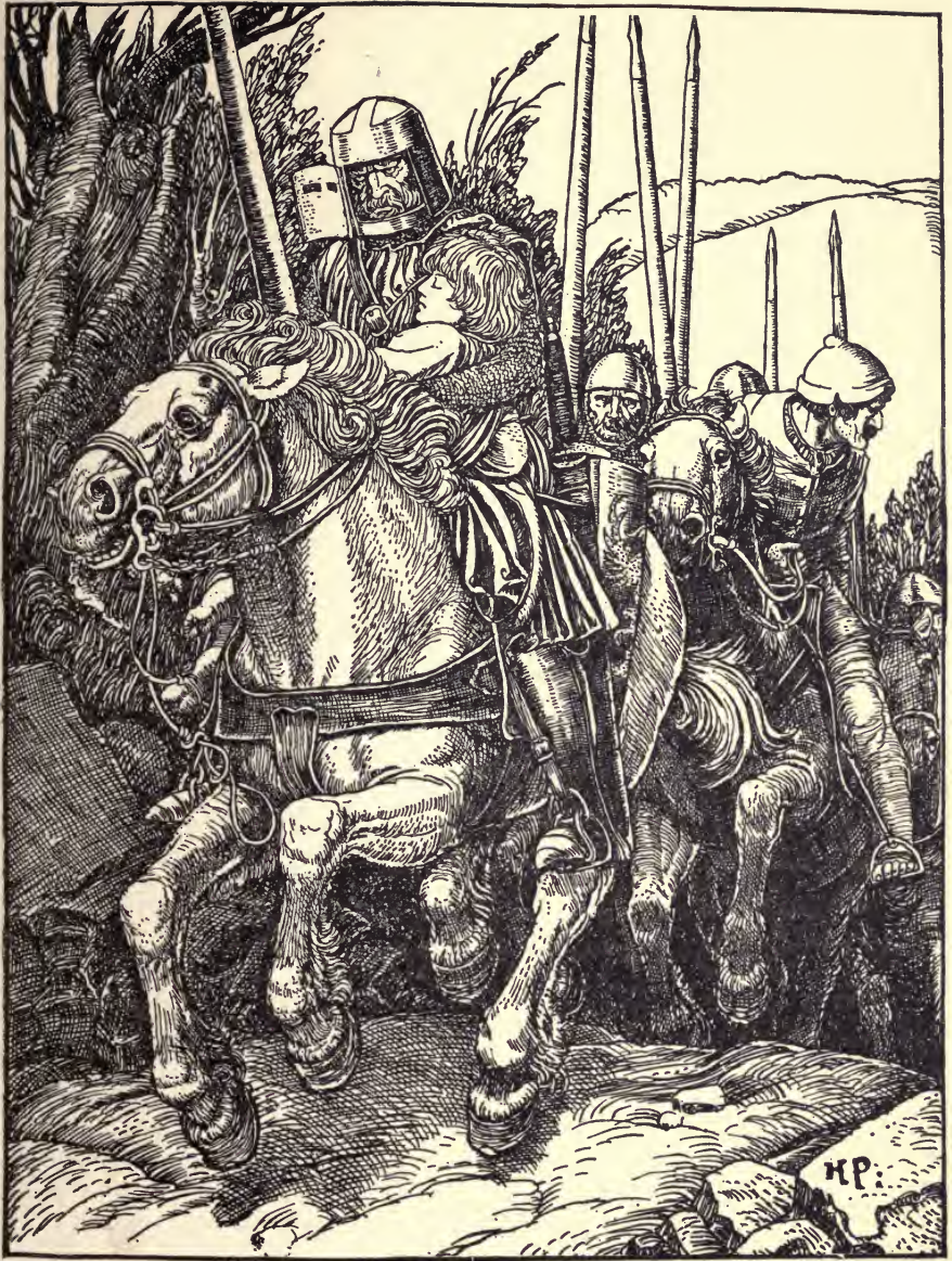
HE WAS GAZING STRAIGHT BEFORE HIM WITH A SET AND STONY FACE.