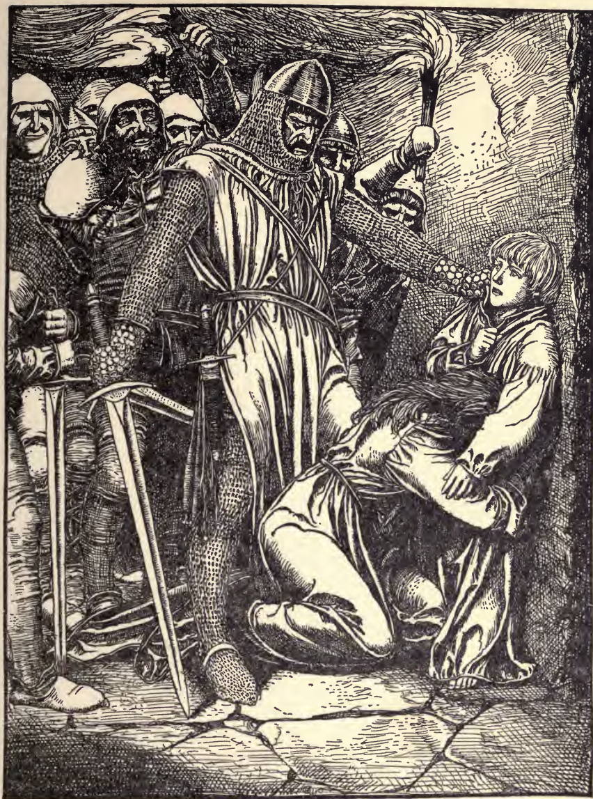
HE STRODE FORWARD INTO THE ROOM AND LAID HIS HAND HEAVILY ON THE BOY'S SHOULDER.