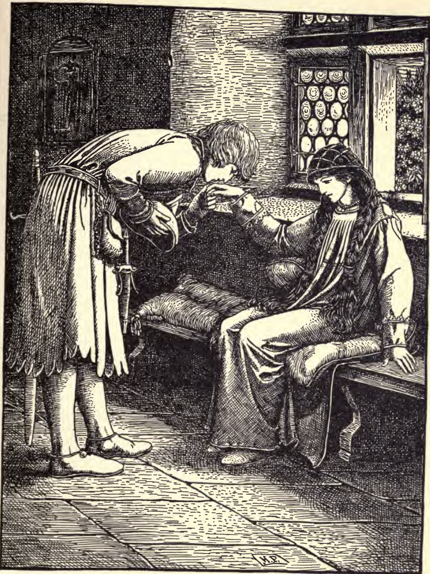
HE TOOK HER HAND AND SET IT TO HIS LIPS.