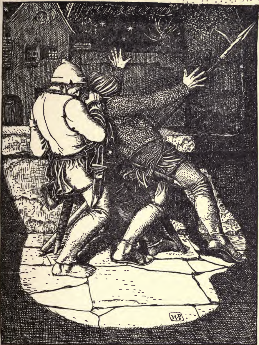
IN AN INSTANT HE WAS FLUNG BACK AND DOWN.