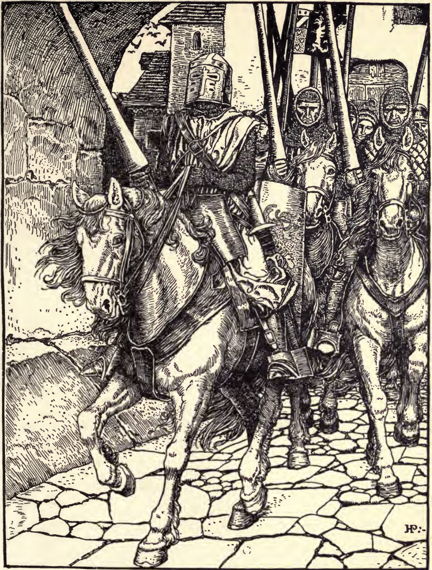
AWAY THEY RODE WITH CLASHING HOOFS AND RINGING ARMOR.