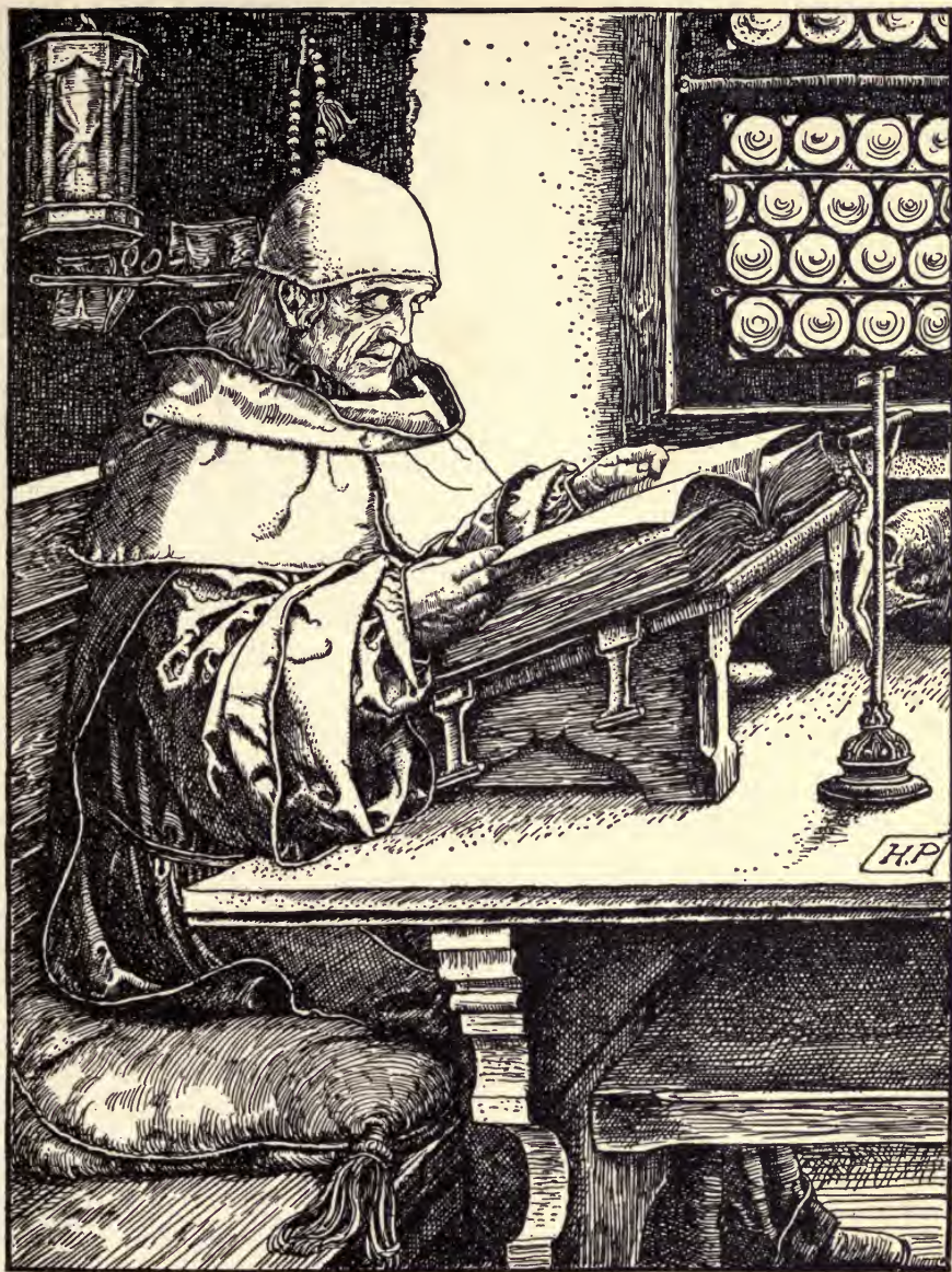
ABBOT OTTO, OF ST. MICHAELSBURG, WAS A GENTLE, PATIENT, PALE-FACED OLD MAN.