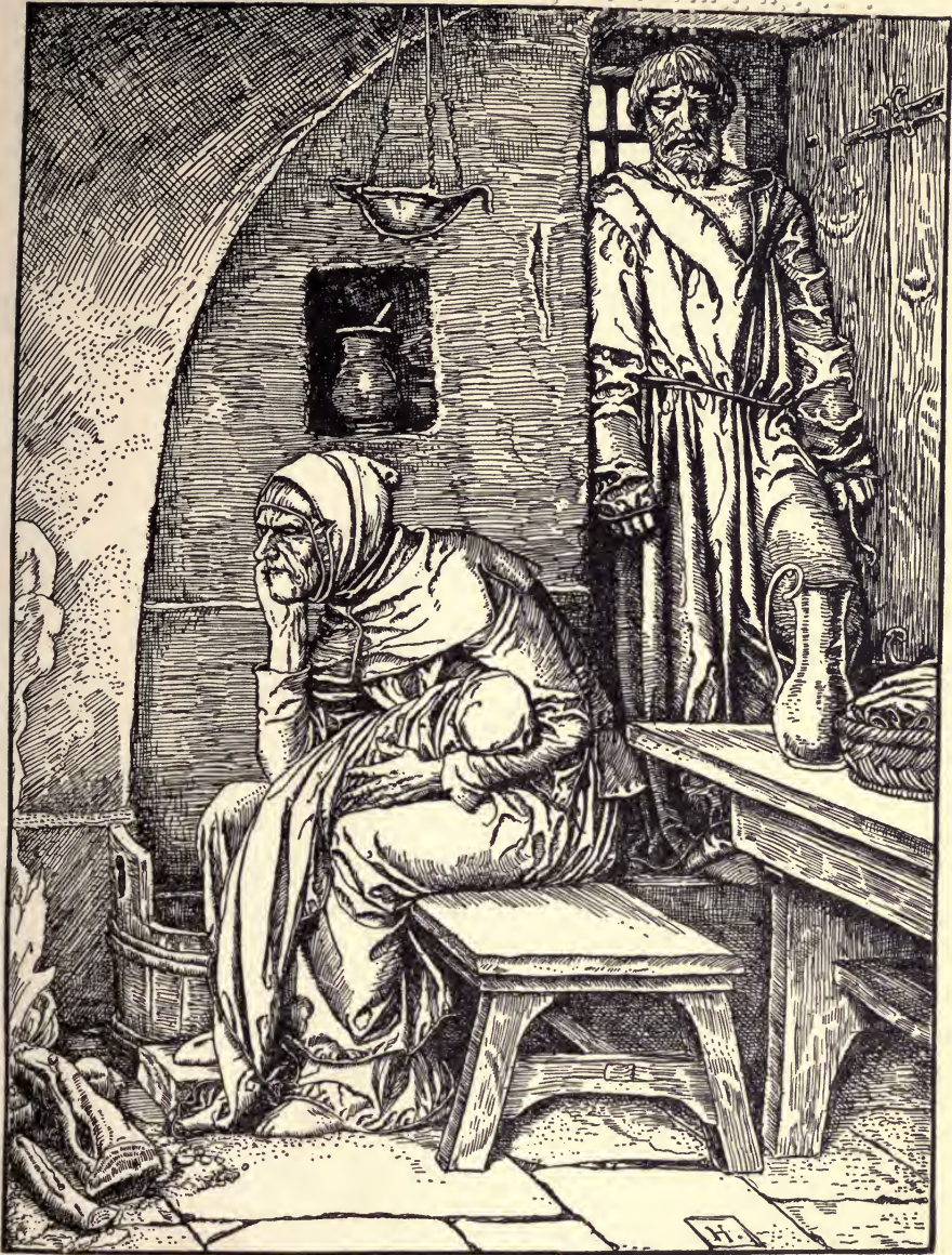
NO ONE WAS WITHIN BUT OLD URSELA, WHO SAT CROONING OVER A FIRE.