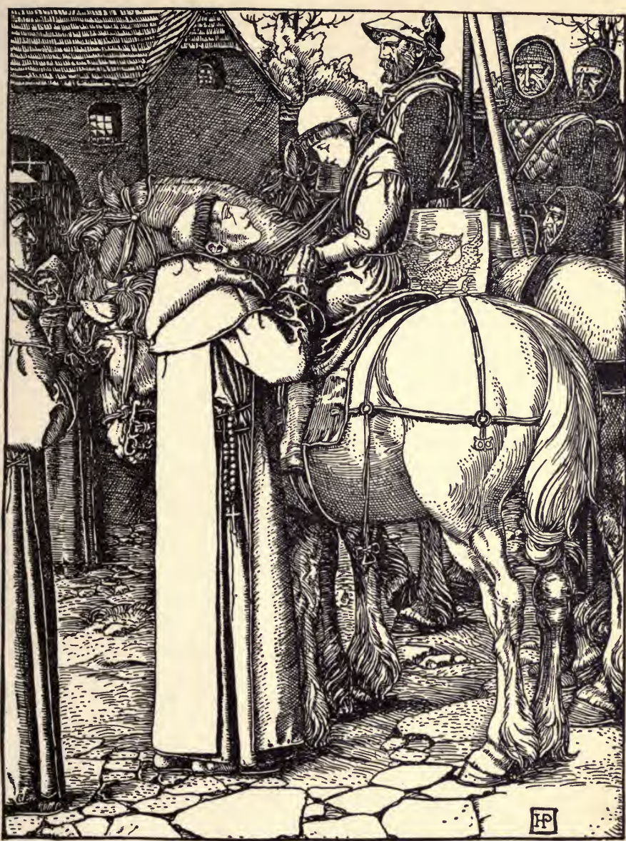
POOR BROTHER JOHN CAME FORWARD AND TOOK THE BOY'S HAND.