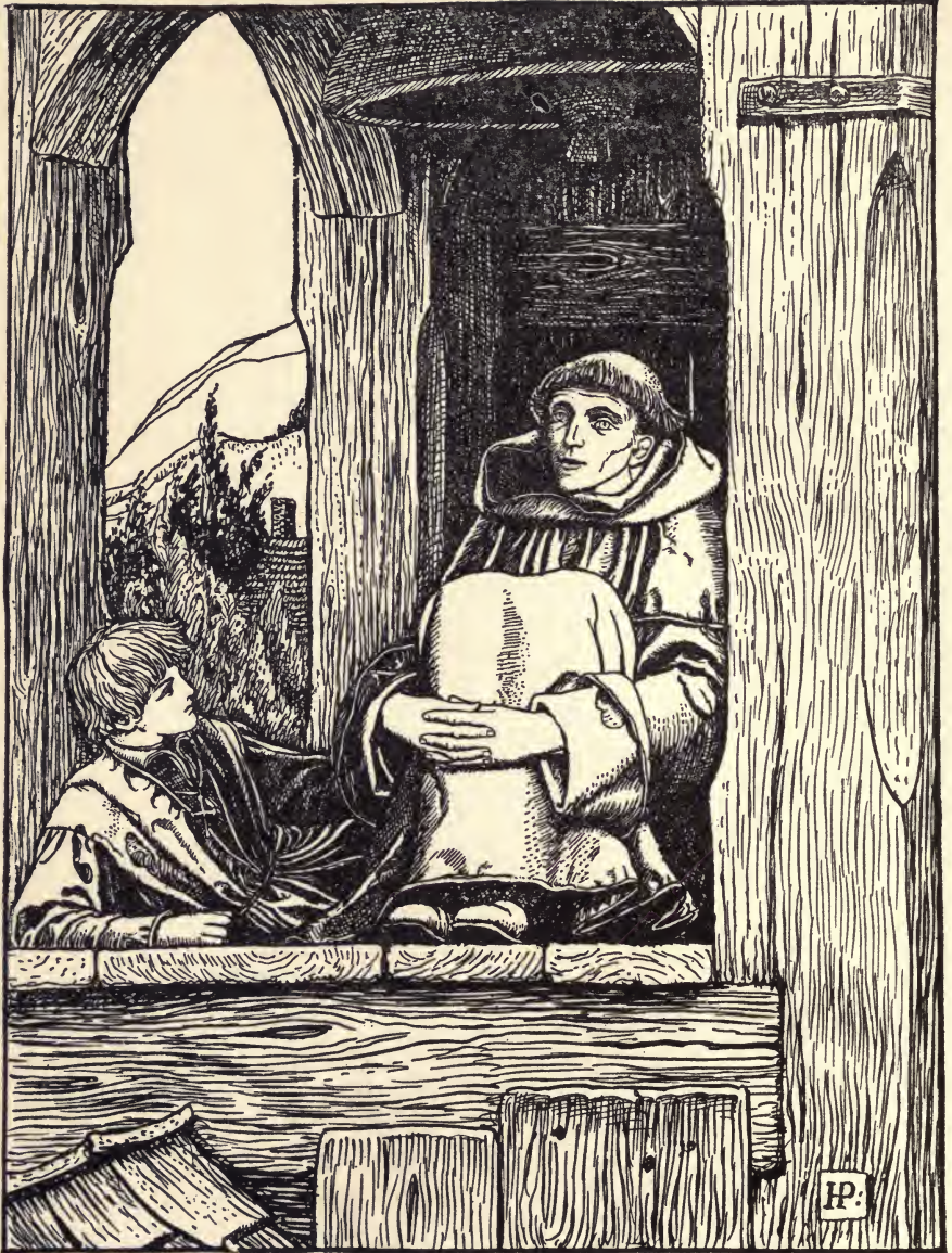
IN THE BELFRY.