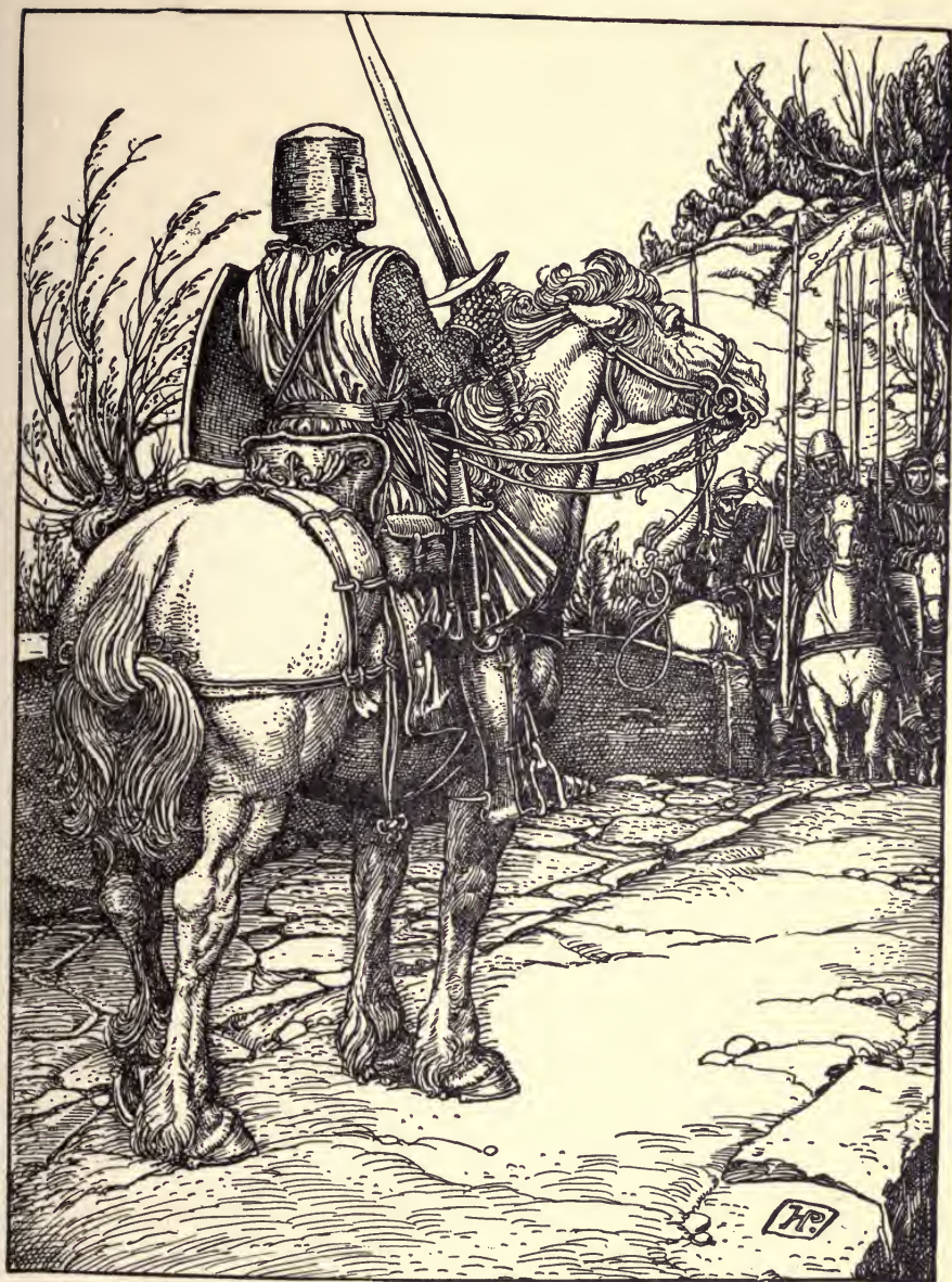
IN THE MIDDLE OF THE NARROW WAY STOOD THE-MOTIONLESS, STEEL-CLAD FIGURE.