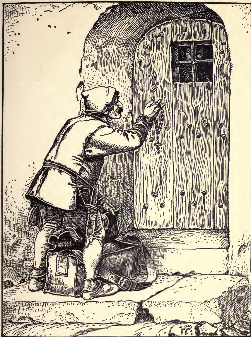
HANS HELD UP A NECKLACE OF BLUE AND WHITE BEADS.