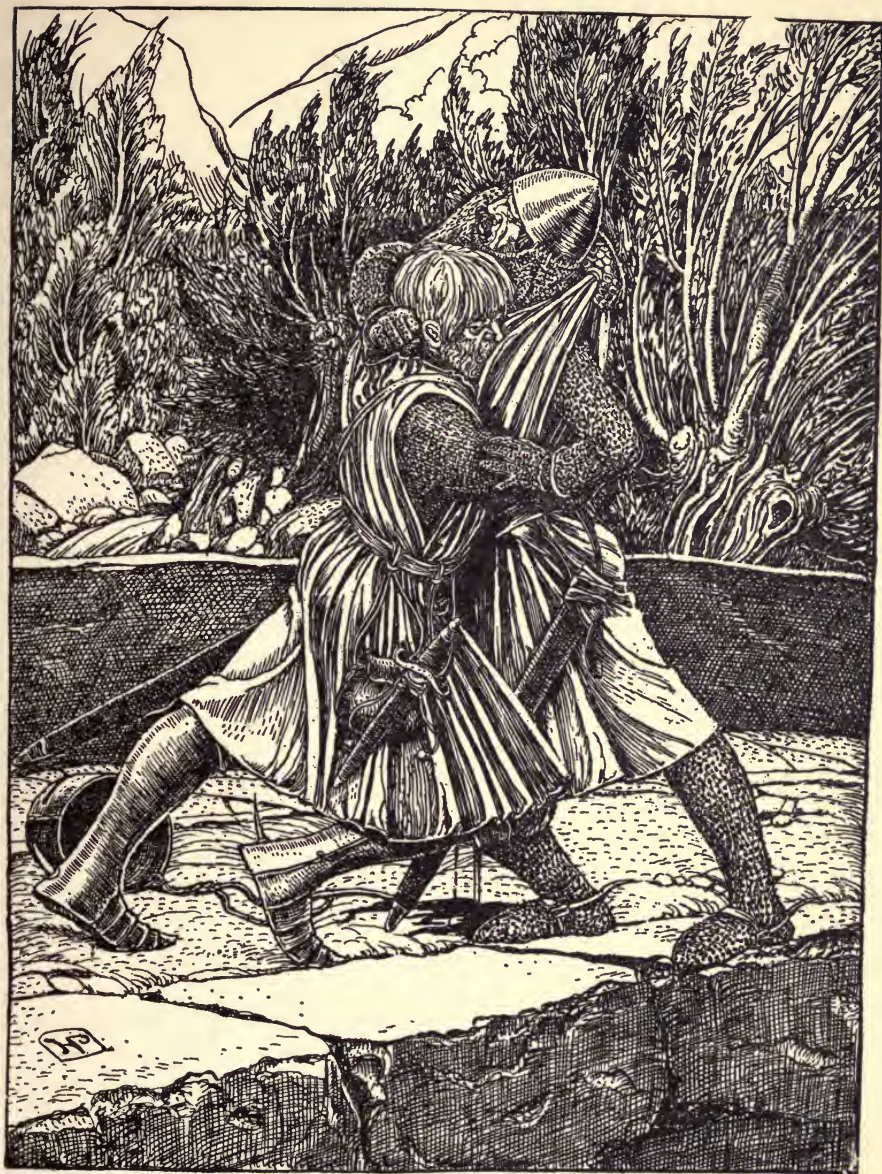
FOR A MOMENT THEY STOOD SWAYING BACKWARD AND FORWARD.