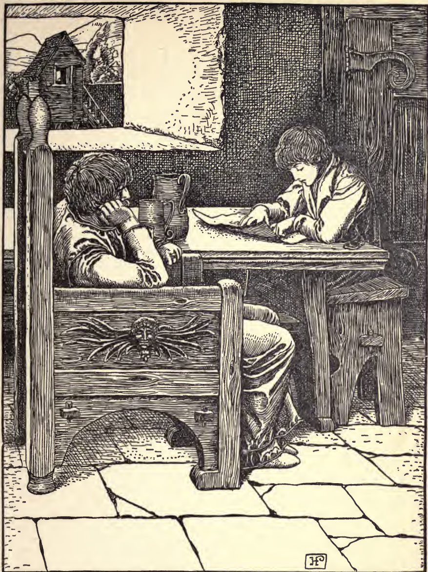
THE GRIM BARON SAT SILENT WITH HIS CHIN RESTING UPON HIS CLENCHED FIST.