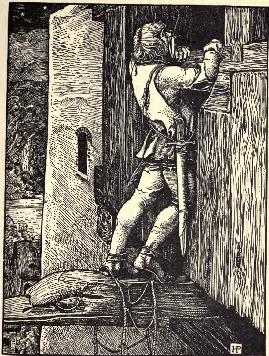
SLOWLY RAISING HIMSELF UPON THE NARROW FOOTHOLD HE PEEPED CAUTIOUSLY WITHIN.