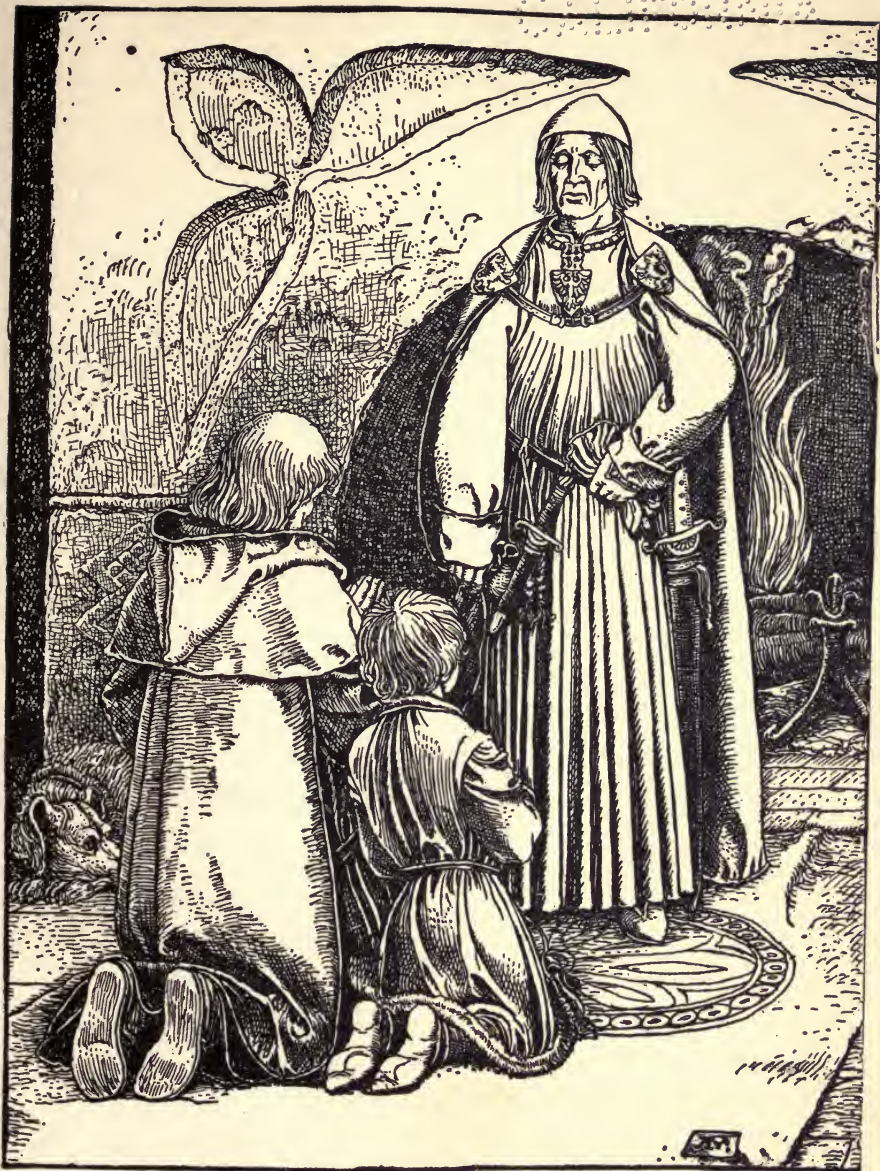
IT WAS THE GREAT EMPEROR RUDOLPH.