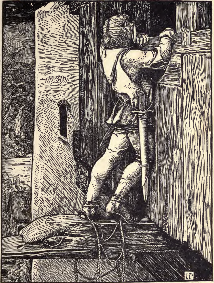
SLOWLY RAISING HIMSELF UPON THE NARROW FOOTHOLD HE PEEPED CAUTIOUSLY WITHIN.