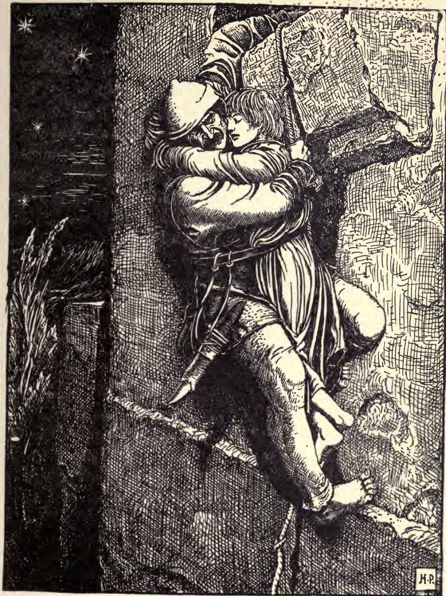
THE NEXT MOMENT THEY WERE HANGING IN MID-AIR.