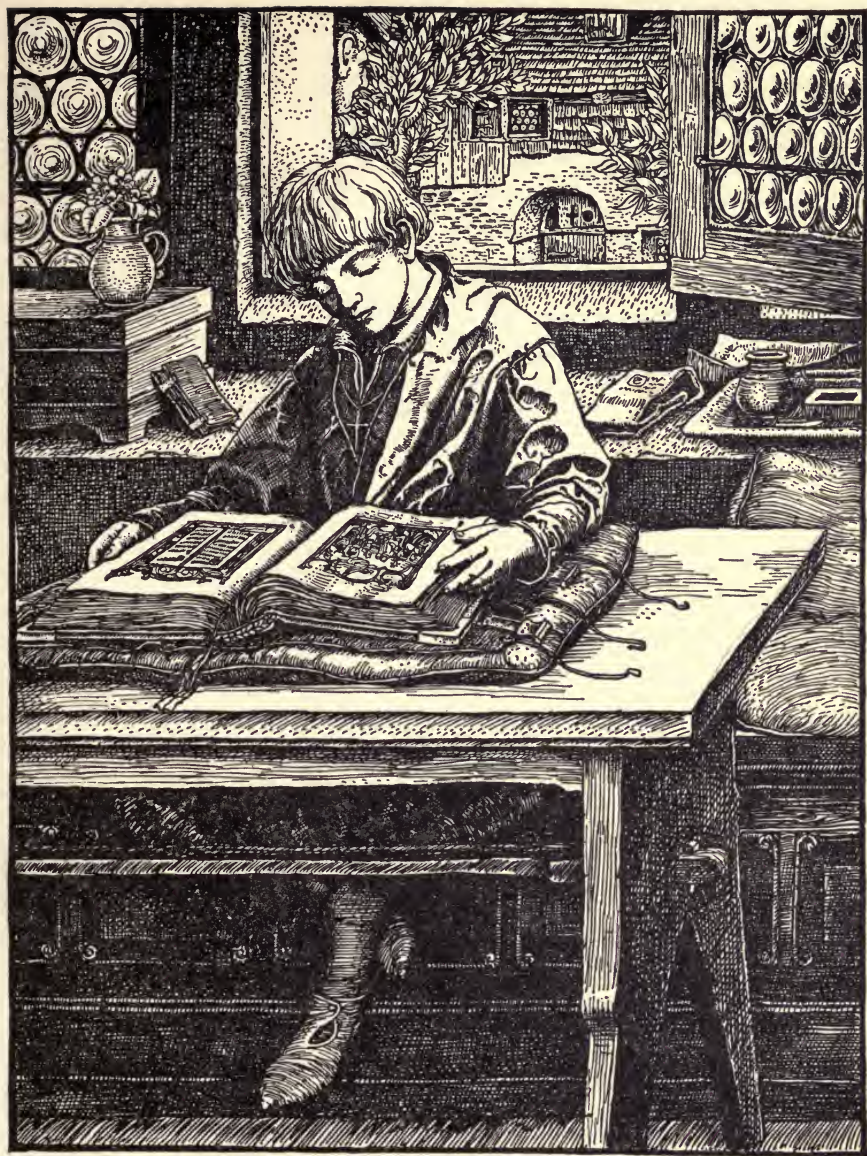
ALWAYS IT WAS ONE PICTURE THAT LITTLE OTTO SOUGHT.