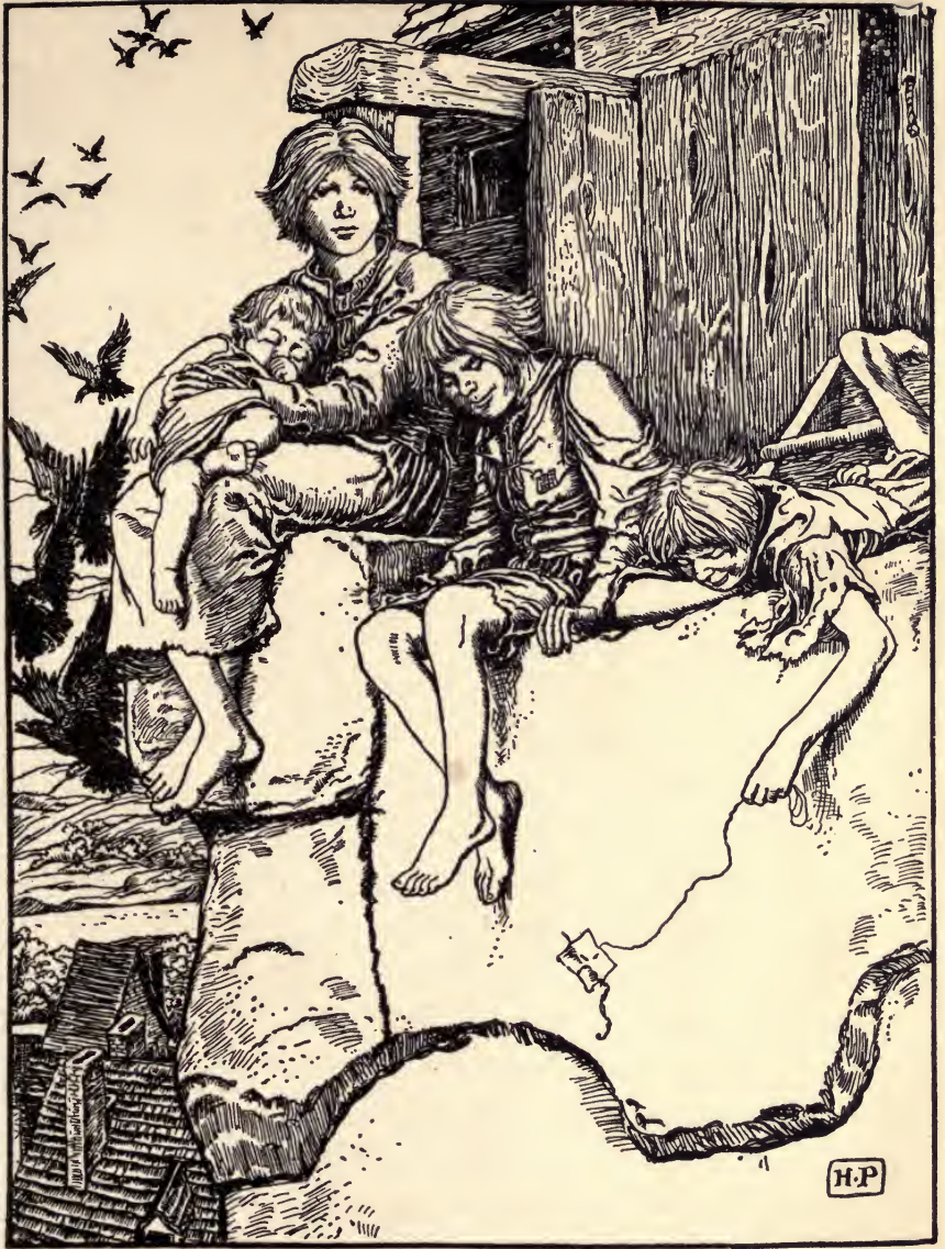
THERE THEY SAT, JUST AS LITTLE CHILDREN IN THE TOWN MIGHT SIT UPON THEIR FATHER'S DOOR-STEP.