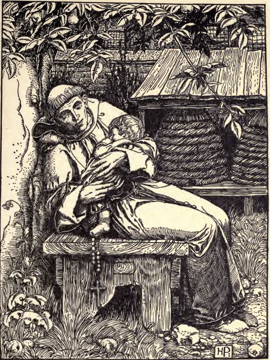
THE POOR, SIMPLE BROTHER SITTING UNDER THE PEAR-TREE, CLOSE TO THE BEE-HIVES, ROCKING THE LITTLE BABY IN HIS ARMS.